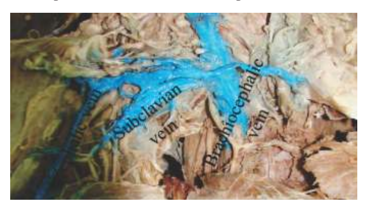
Fig. 2: Insertion of Cephalic Vein to Brachiocephalic vein