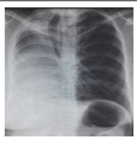
Fig. 1: Chest X-Ray Postero-Anterior View Showing a Homogenous Opacity in Right Hemithorax with Mediastinal Shift to Right