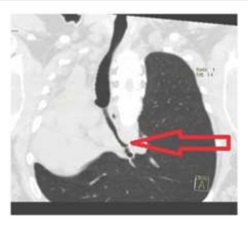
Fig. 2: Reconstruction Image of Computed Tomography Thorax Showing Left Lower Lobe Bronchus Narrowing (Red Arrow) with Over-inflation of the Left Lung